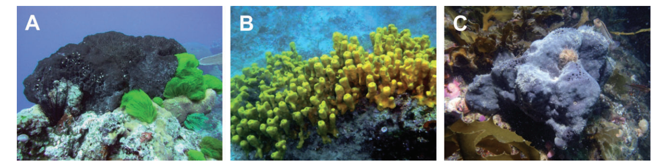
Fig. 3. Photographic examples of model sponge species currently being utilized to explore multiple aspects of microbial symbiosis. A. Rhopaloeides odorabile from the Great Barrier Reef.

B. Aplysina aerophoba from the Mediterranean.